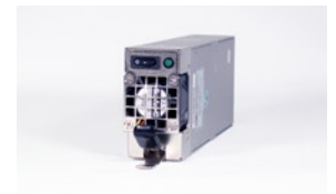
Clavister Security Gateway 5500 Series - Power Supply Module