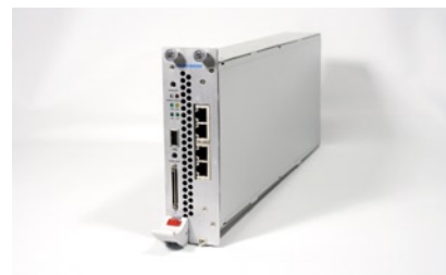
Clavister Security Gateway 5500 Series - Secure Blade Module