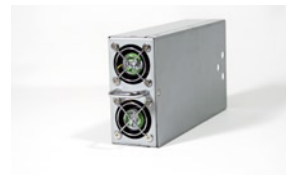
Clavister Security Gateway 5500 Series - Cooling FAN Module